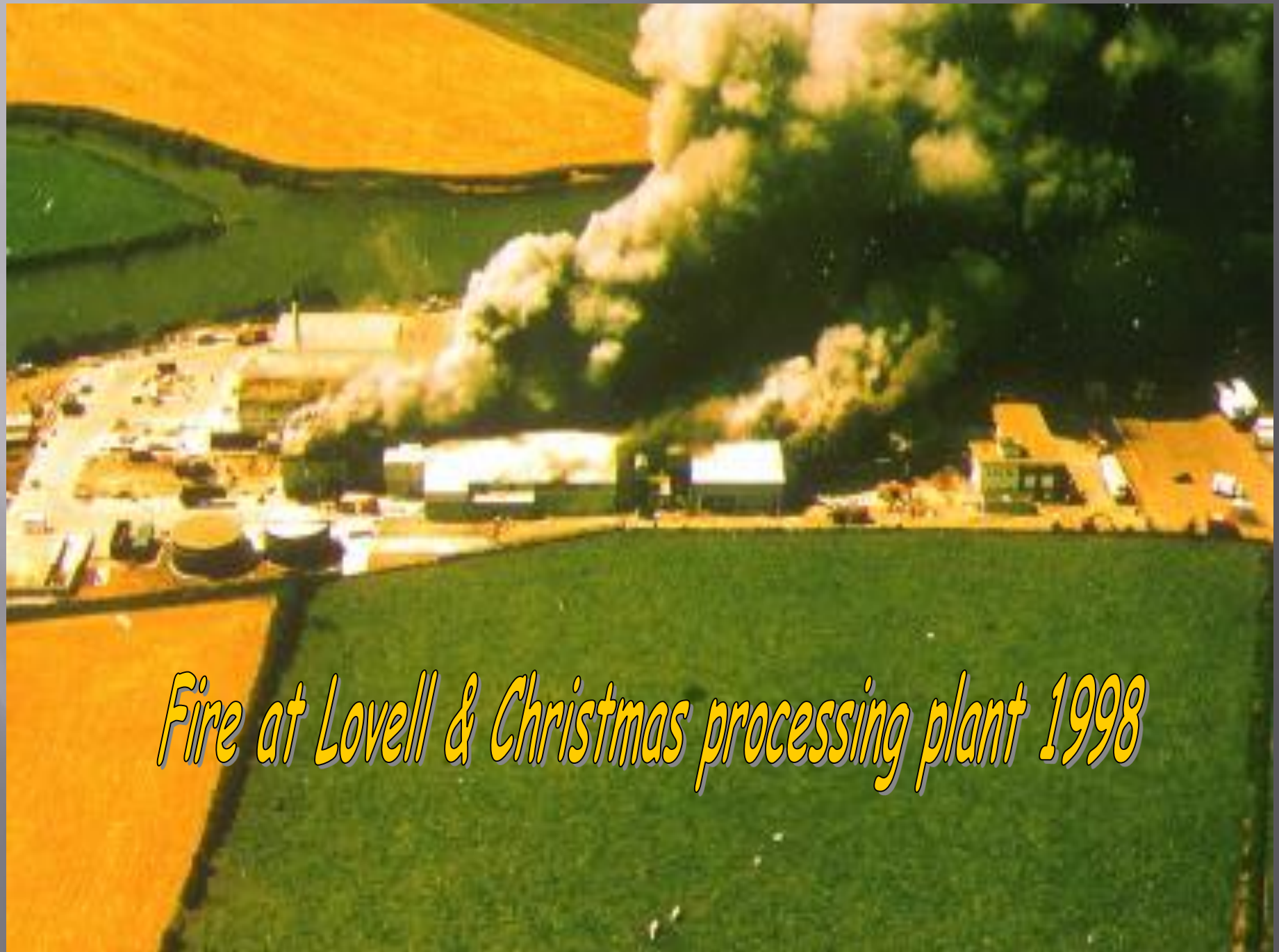
Fire at Lovell & Christmas processing plant 1998